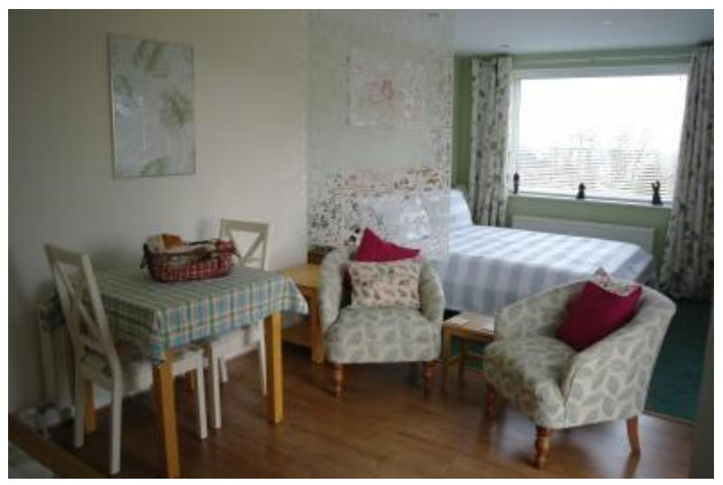
living area / Studio