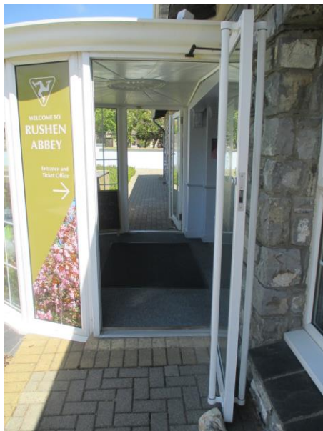
Main entrance – single glass door

Access to Rushen Abbey is through a single glass door. The single glass door is heavy and not automated. The door opens outwards. The main entrance is completely level.