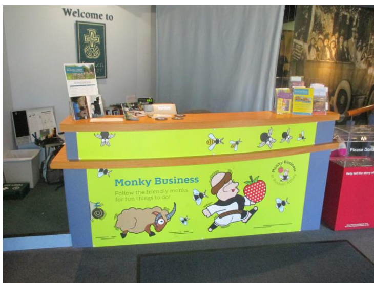
Main reception area and shop counter

The main entrance has a medium height counter and is well lit. There is an induction hearing loop fitted. The reception desk is staffed at all time, and our team is happy to help.