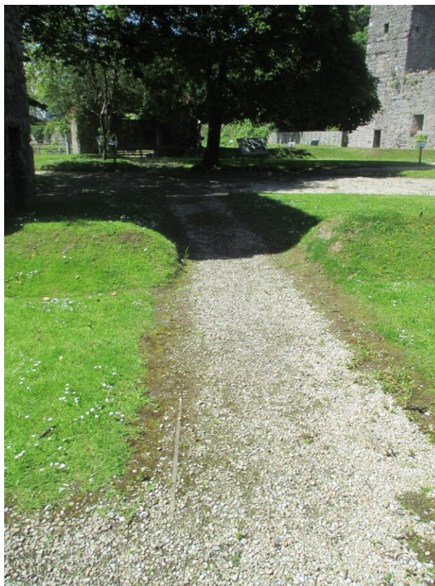
Example of Abbey ground paths – compacted earth topped with gravel