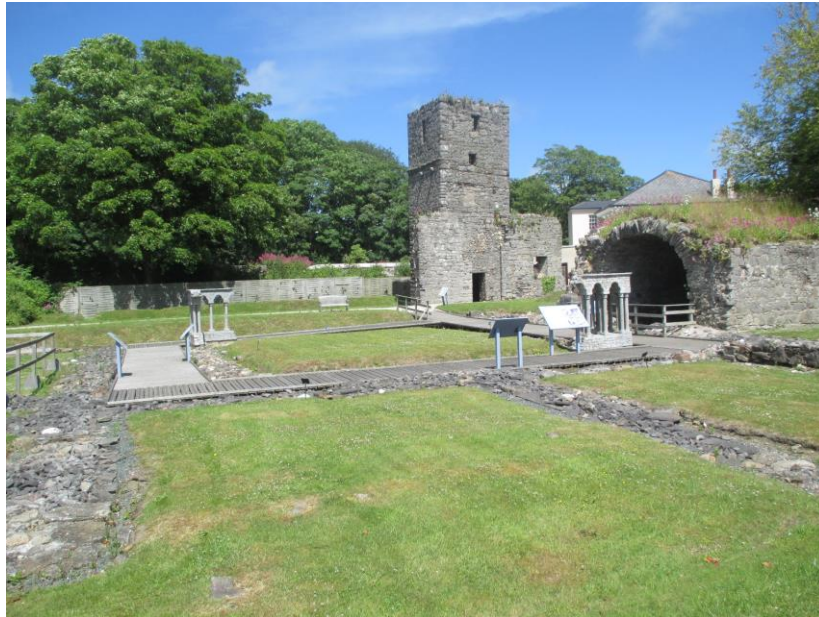
Decked wooden paths amongst Abbey ruins