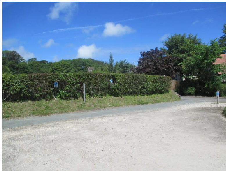
Disabled parking in main car park

There is a car park on site, which has four marked disabled parking spaces. The car park surface is compacted earth topped with gravel/loose chippings. The car park is uneven in places. Visitors using wheelchairs may require assistance due to the uneven surface.