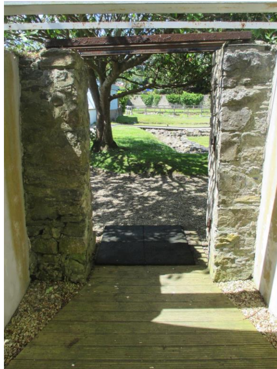
Sloped, decked access from courtyard to Abbey grounds