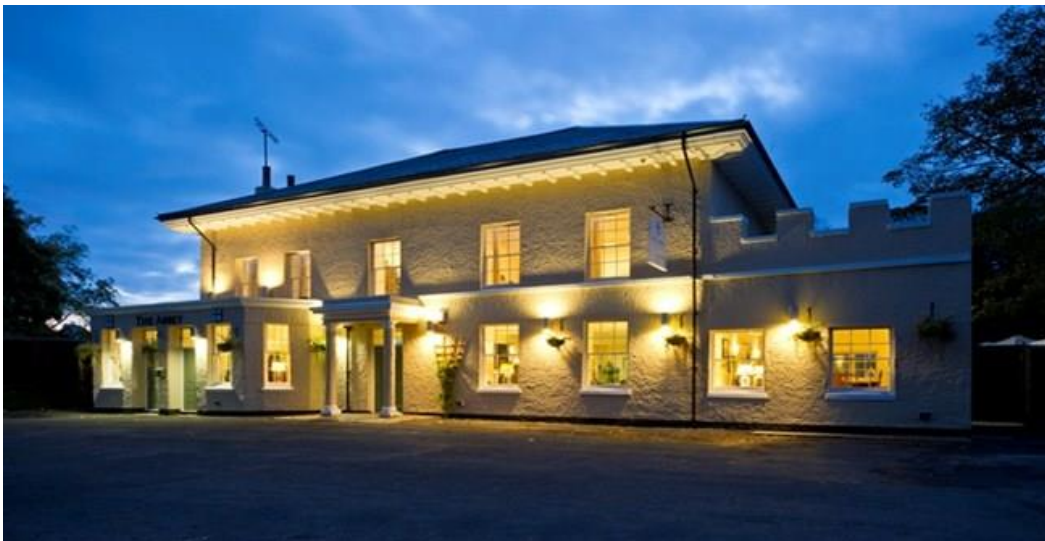
The Abbey Restaurant

For more information on access needs, dietary requirements or to book a table please contact the Abbey Restaurant on 01624 822393 or email manager@theabbeyrestaurant.co.im .