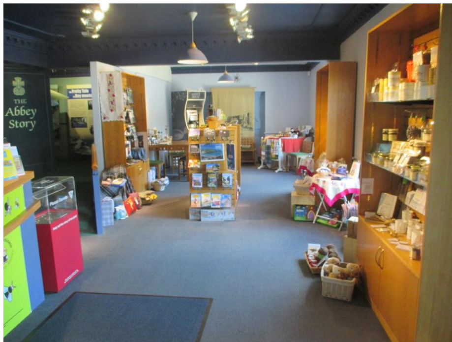
Rushen Abbey Gift Shop

There is small refreshment area to the rear of the shop. Hot drinks and snacks are available. There is seating available. Please ask a member of staff if you require assistance.