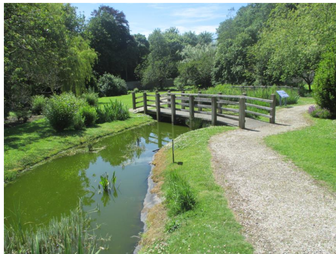
Pond to the left hand side of the site – please keep an eye on young children

Please note there is a large unfenced pond to the far left hand side of the garden. Please familiarise yourself with the pond's location and take extra care when children are playing in this area.