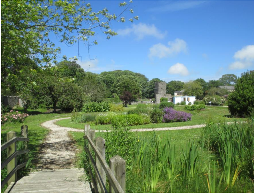
Gravel path around Abbey grounds – showing gardens, pond and bridge