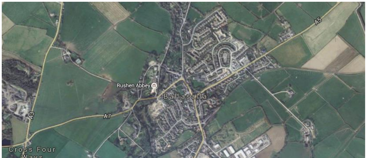
Google map of Ballasalla Village