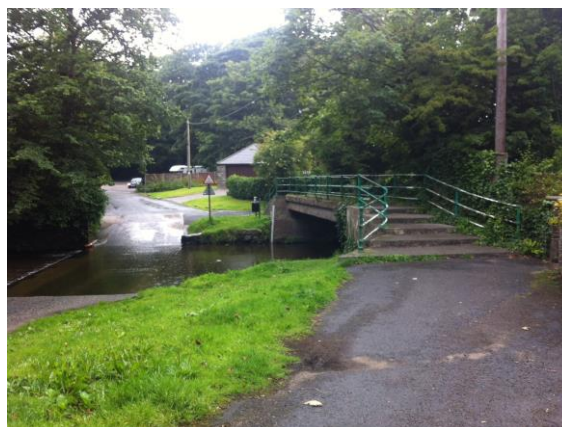
Mill Road ford footbridge

One approach to Rushen Abbey is via the ford on Mill Road near to Silverdale Glen. Visitors with mobility impairments should note that the ford is crossed via a stone bridge with five large steps up and down. There is a hand rail.