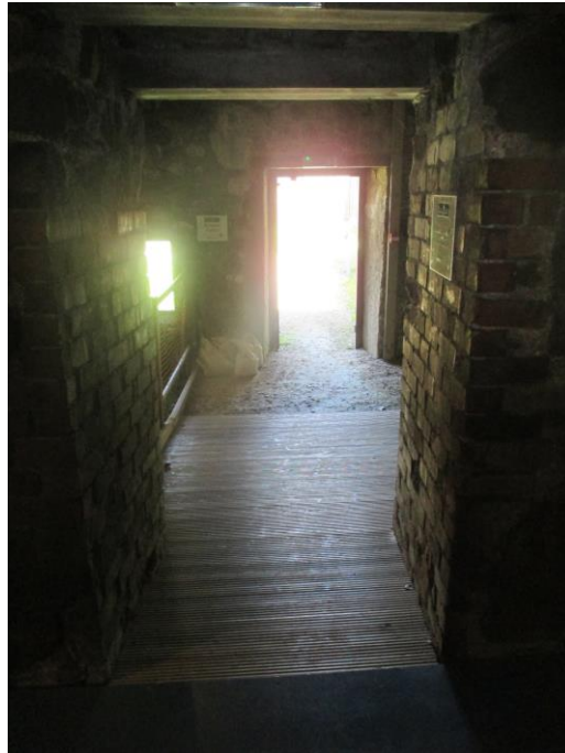
Decked and uneven floor finish leading from visitor centre to Abbey grounds