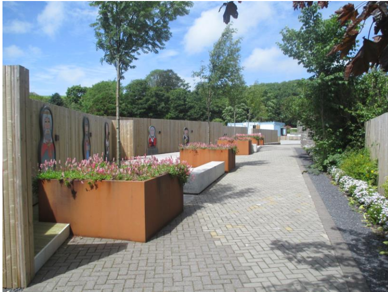
Paved pathway to visitor centre