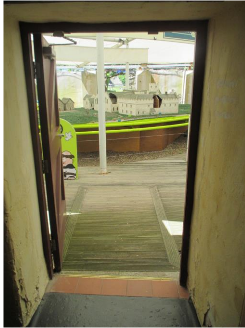
Ramped access from visitor to courtyard – note differing floor finishes