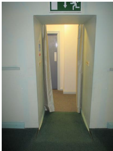
Entrance to toilet block – showing ramp

The male and female toilets both contain changing facilities for babies and toddlers.