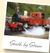
South by Steam

Rocking gently through beautiful countryside watching the train's 'breath' drift by is a timeless experience for rail enthusiasts and visitors of all ages.