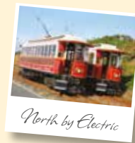
North by Electric

If you want to explore the north of the Island, do so in Victorian style by taking a charming electric tramcar. The 17 1/2 mile route from Douglas to Ramsey hugs the Island's east coast, passing through gorse topped hills, glorious Victorian glens and spectacular coastal scenery.