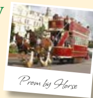
Prom by Horse

See Horse Tram timetable leaflet, copies available from the Welcome Centre, Sea Terminal, Douglas.