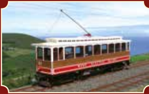
MER tram 21 £24.95