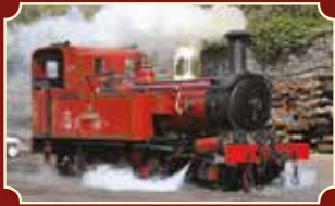
Loco No. 12 Hutchinson £19.95