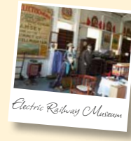
Electric Railway Museum

The Manx Electric Railway was one of the earliest electric railways in the British Isles. There is now a dedicated museum where you can learn more about the history of this pioneering railway. The museum is located inside the main depot at Derby Castle. Open from midday until 4.30pm every Sunday during the MER season. FREE entry.