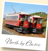
North by Electric

If you want to explore the north of the Island, do so in Victorian style by taking a charming electric tramcar. The 17 1/2 mile route from Douglas to Ramsey hugs the Island's east coast, passing through gorse topped hills, glorious Victorian glens and spectacular coastal scenery.