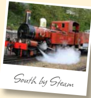
South by Steam

Rocking gently through beautiful countryside watching the train's 'breath' drift by is a timeless experience for rail enthusiasts and visitors of all ages.