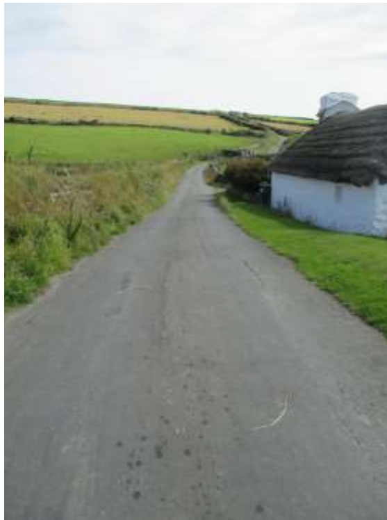
Road leading from the Village to Spanish Head

Tarmacked road. Steep incline. Also used by vehicles.