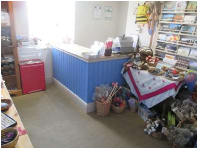
Entrance desk in Cummal Beg Visitor Centre

Cummal Beg also contains a gift shop and film room detailing the history of Cregneash. There is also an exhibition room upstairs in Cummal Beg. It is accessed by 12 steps.