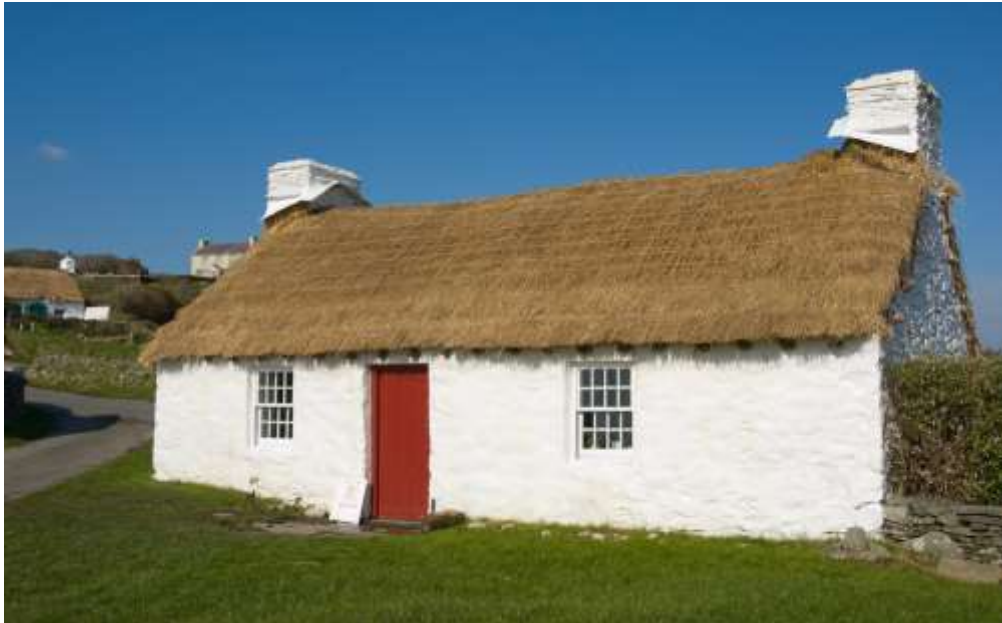
Harry Kelly's Cottage in Cregneash Village

Cregneash is situated in the far south of the Isle of Man. It is a small crofting village with cottages that can be explored. It is an open air site. Buildings to explore include Harry Kelly's Cottage, Crebbin's Cottage, Church Farm, Quirk's Croft, Ned Beg's Cottage for Manx language, St Peter's Church, the Joiner's Workshop and Smithy, and the Creg y Shee Tea Room.