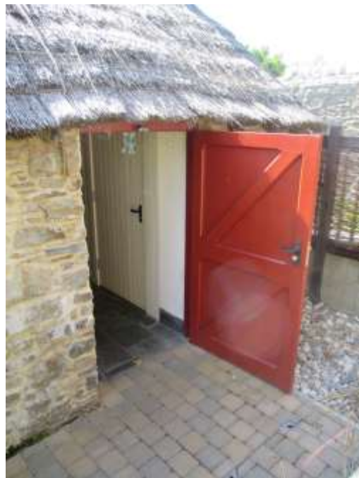
Entrance to Quirk's Croft Accessible Toilets (91cm Width)