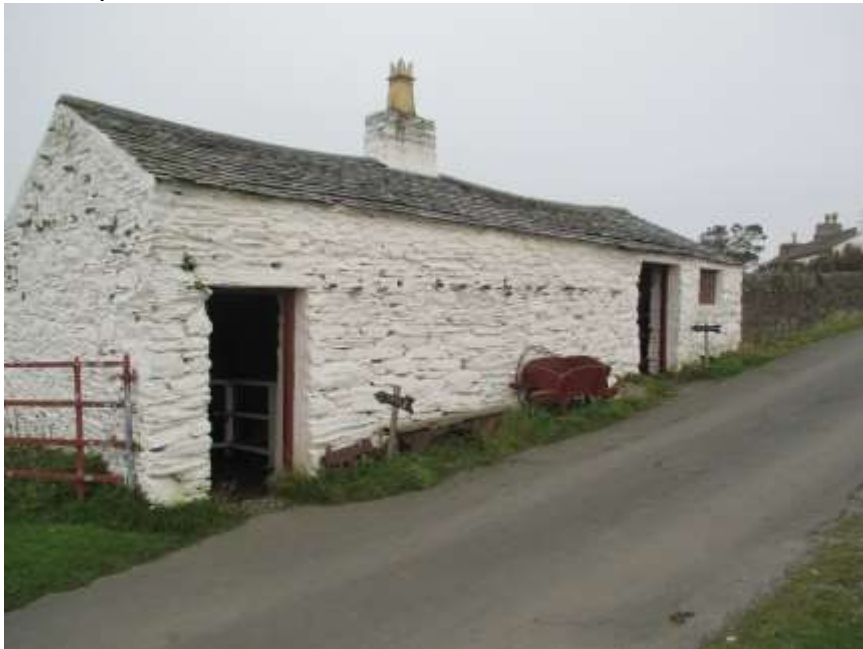
Joiner's Workshop & Smithy