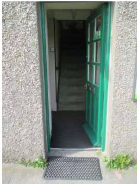
Entrance door way to Cummal Beg Visitor Centre (60cm wide doorway)

The entrance desk is situated in Cummal Beg Visitor Centre. It has a level entrance although there is an uneven surface (see below). The entrance way is 60cm wide.