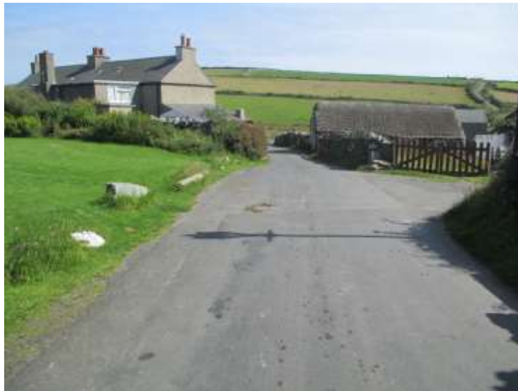
Main road through village

Tarmacked, slight incline. Also used by vehicles.