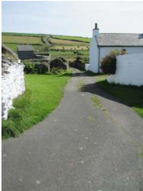
Road leading from Crebbin's Cottage to Harry Kelly's Cottage