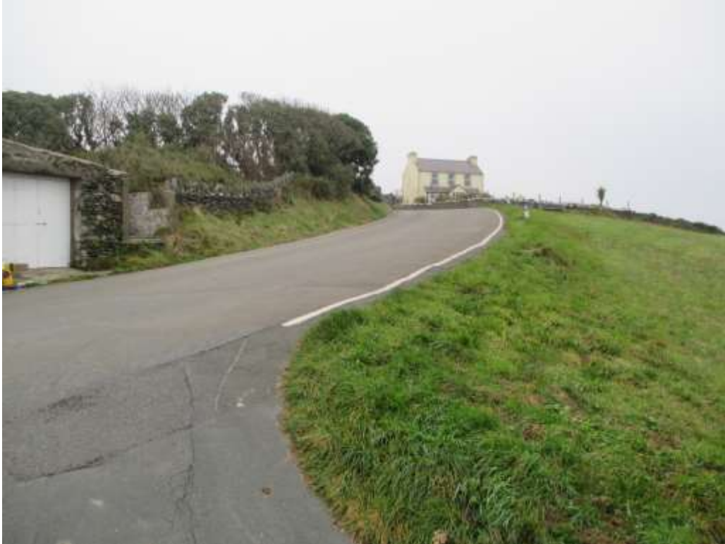
Coach drop off point (NB: drop off point only - coaches cannot park here)