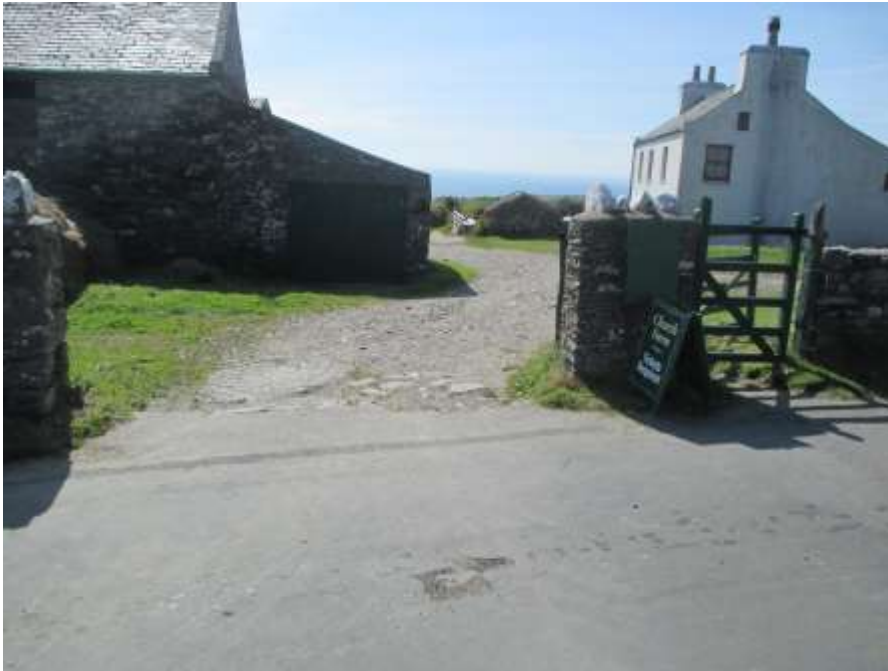
Church Farm Yard