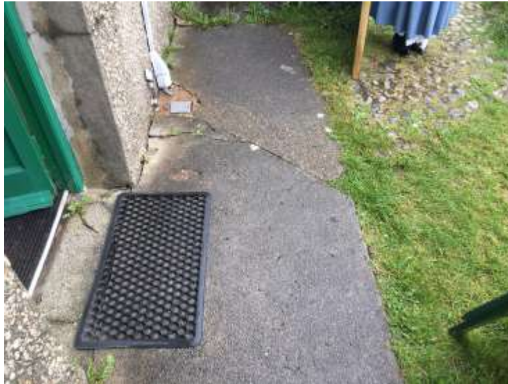
Entrance to Cummal Beg Visitor Centre

Cummal Beg also contains a gift shop and film room detailing the history of Cregneash. There is also an exhibition room upstairs in Cummal Beg. It is accessed by 12 steps.