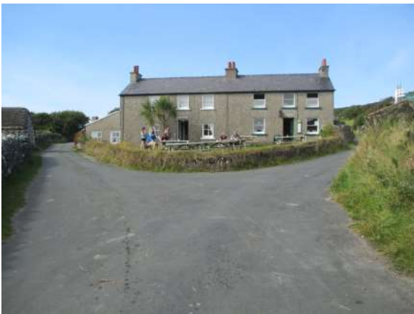
Creg y Shee Tea Room

If you would like your baby food or milk heating up please ask the staff who are happy to help.