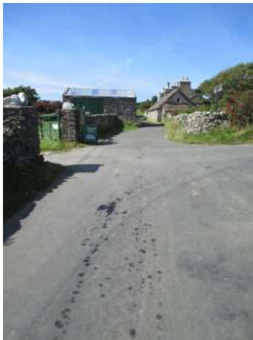
Road leading to Quirk's Croft

Tarmacked road. Moderate incline. Also used by vehicles.