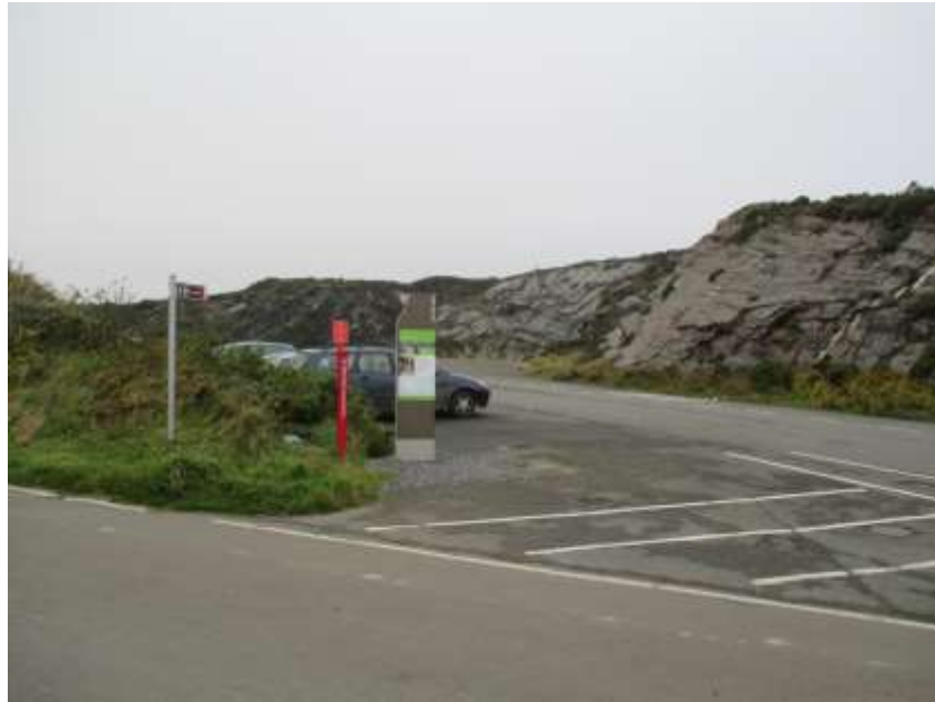
Cregneash Main Car Park (Quarry Car Park)