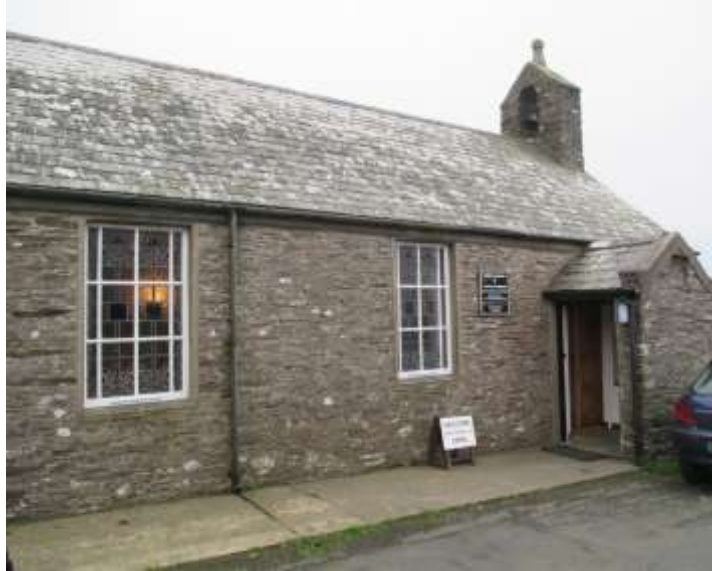
St Peter's Church