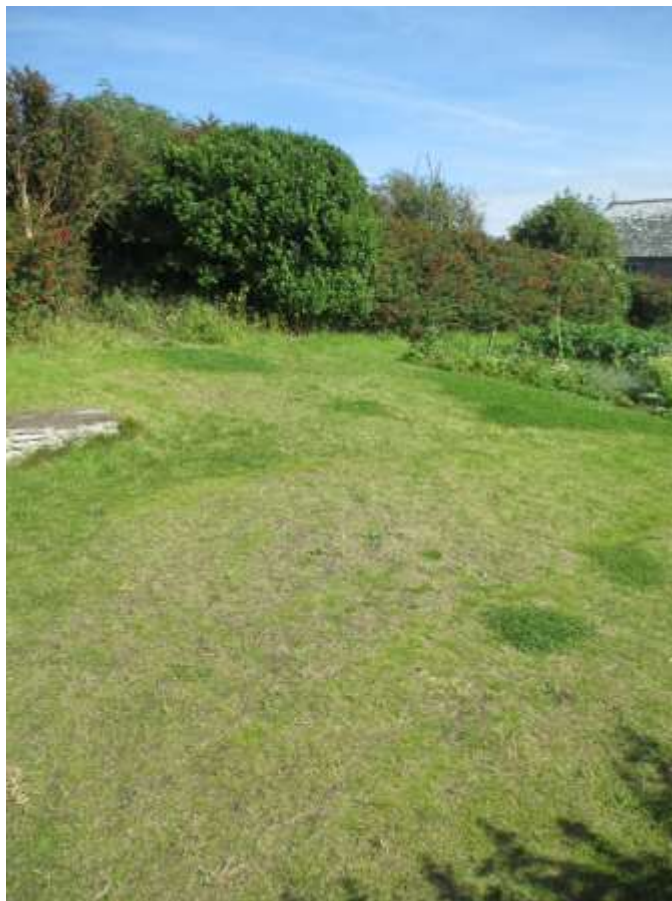
Quirk's Croft Garden leading to Castruan Gardens (grassed, uneven, with small incline)