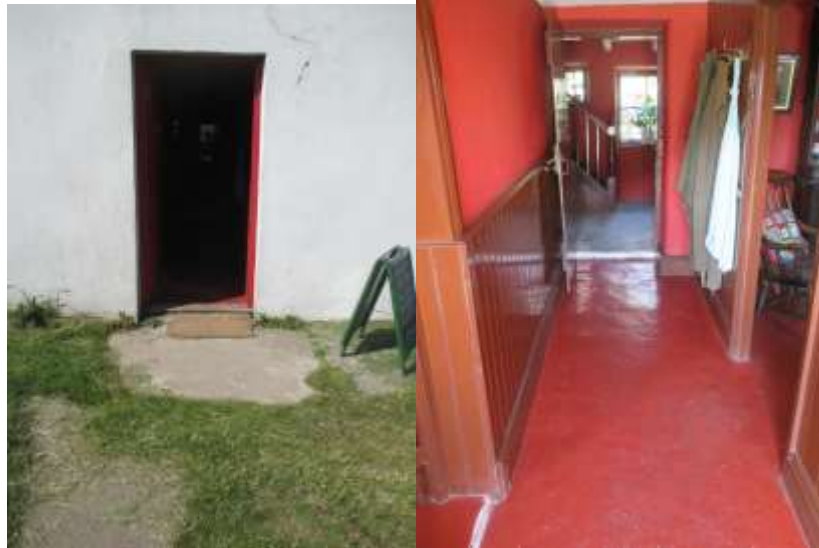
Doorway to Church Farm and Interior of Church Farm (showing slight steps)

Door way to Church Farm 70cm wide, with a slight step