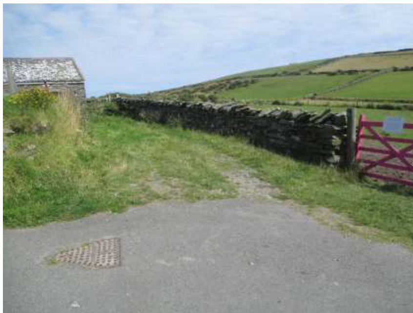
Cregneash Disabled Parking Space (grassed area)