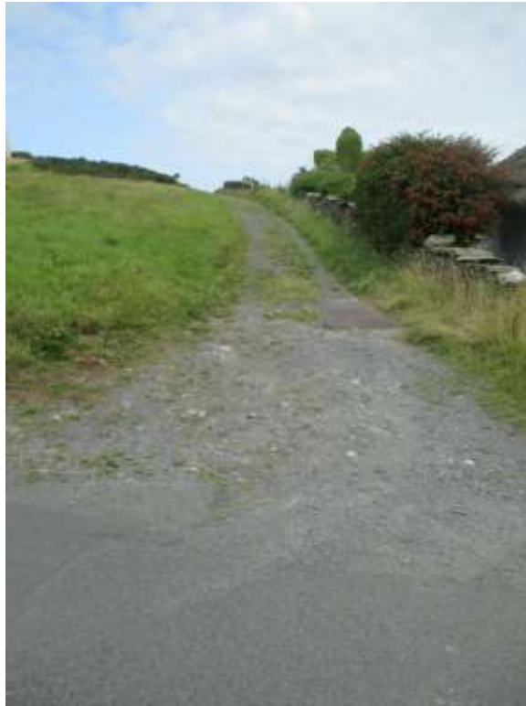
Route from Cregneash to Quarry Car Park (uneven with steep incline)