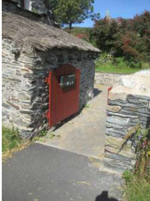
Pathway to Quirk's Croft