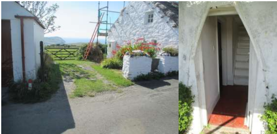
Entrance to Ned Beg's Cottage