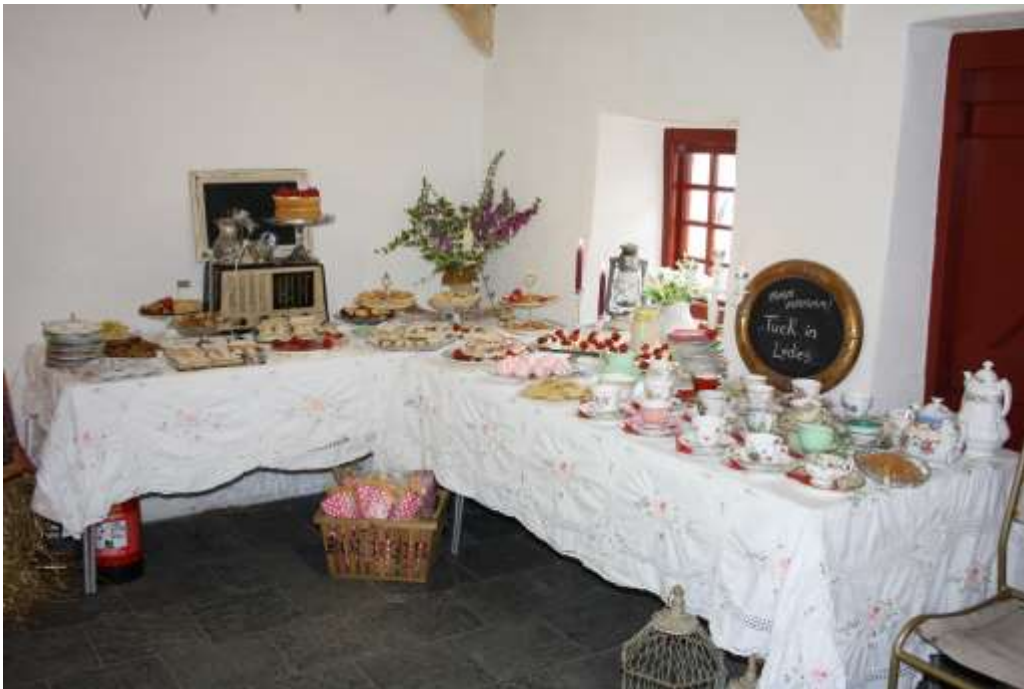
Quirk's Croft Interior

To enquire about hiring Quirk's Croft or any other Manx National Heritage venue please email: venuehire@mnh.gov.im .