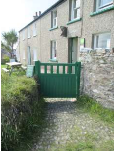
Gated entrance to the Cummal Beg Visitor Centre (94cm wide gateway)

Visitors wishing to explore Cregneash Village should make their way to the visitor centre in the centre of the village. To explore inside the cottages visitors should have an entry ticket.