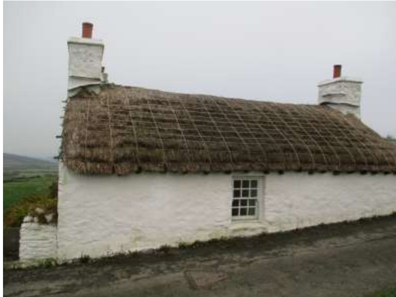
Ned Beg's Cottage