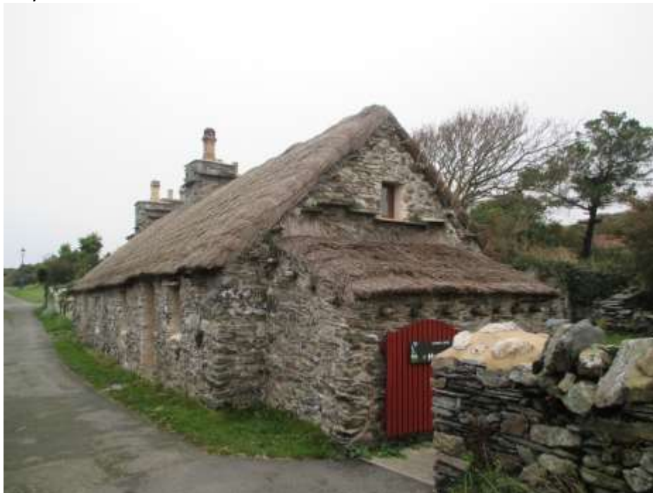
Quirk's Croft and Accessible Toilet Block