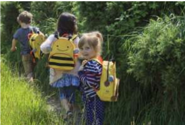
Busy Bee Back Packs

There are baby changing facilities and a comfort area at Quirk's Croft Cottage. The cottage is a warm and comfortable space for taking time out.