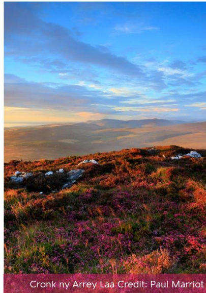
Cronk ny Arrey Laa