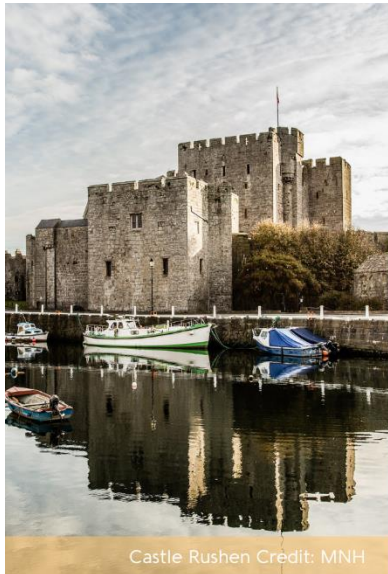
Castle Rushen

Places to visit along the best of the Island's coastal route the Raad ny Foillan