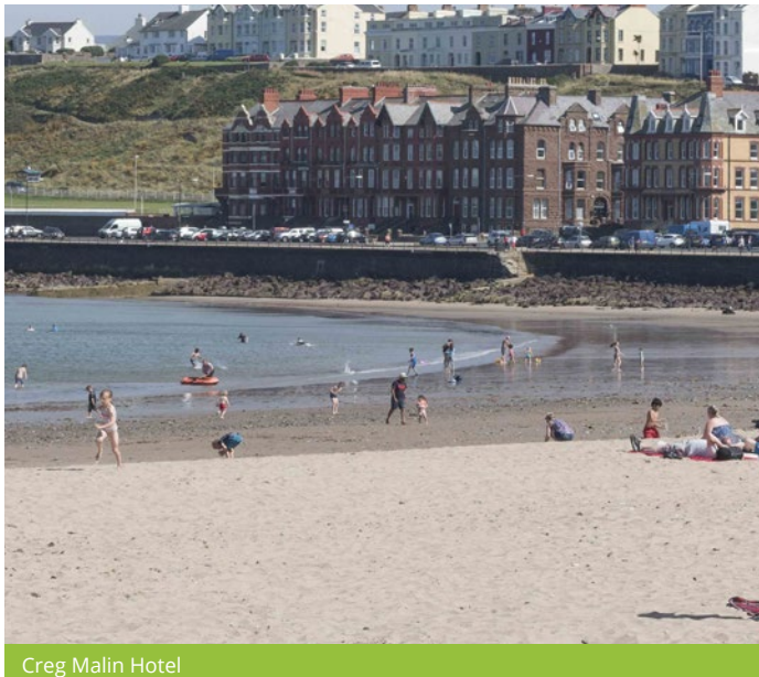
Creg Malin Hotel