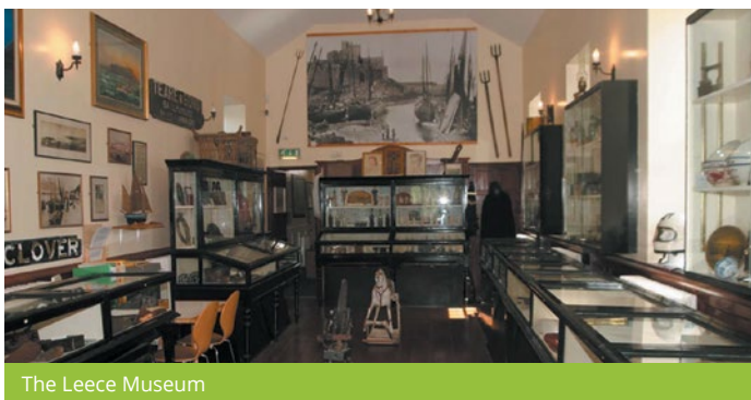
The Leece Museum