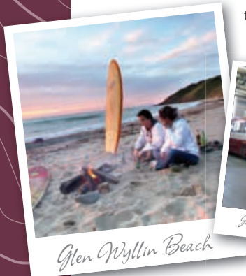
Glen Wyllin Beach

Please check tide timetable before setting off as access is restricted at high tide