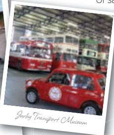
Jurby Transport Museum

Leaving the beach at Sartfield gives access to Jurby – where St Patrick's Church and the nearby Isle of Man Motor Museum and Jurby Transport Museums are well worth visiting.