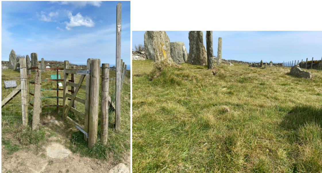
The kissing gate which gives access to the site itself and the uneven ground within its enclosure

The site is accessed by either a large metal gate or a stone stile with a wooden rail at the top. The stones are somewhat uneven and could be slippery. There could be livestock in the field beyond – at the time of writing, there are three small, friendly ponies. The site can be viewed from the gate, but to access it, visitors must proceed approximately 30 metres beyond the stile/metal gate to the kissing gate.