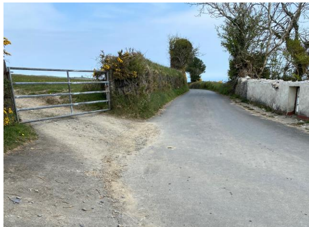
The roadside and cottage wall opposite the site