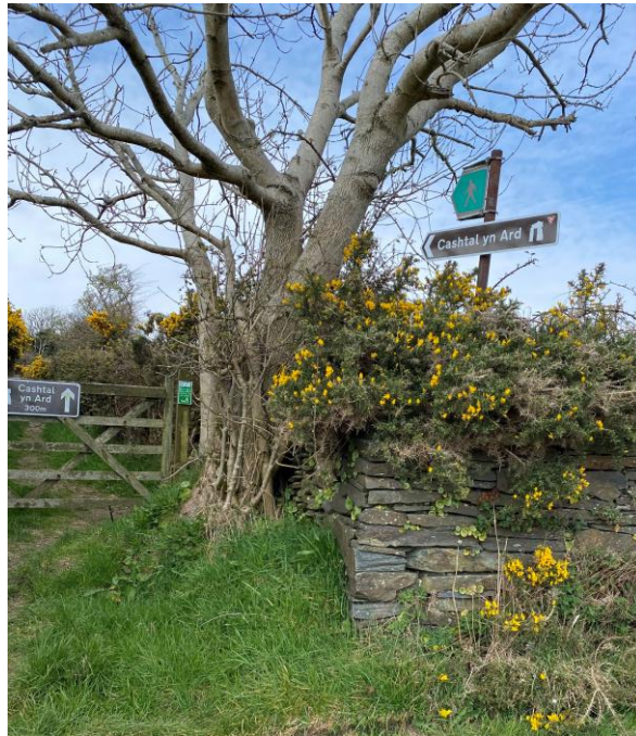
Signposting to Cashtal yn Ard