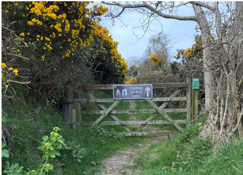
The gate leading to the site is visible from road and signposted.