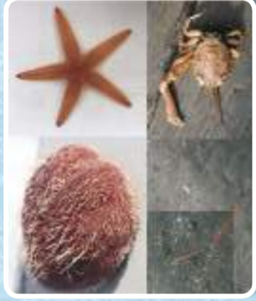
Sandy seabed animals

Rocky reefs provide an attachment site for various marine animals and algae. Over time, wave action creates crevices that increase the available habitat. The rocky intertidal zone is routinely covered and uncovered by the tides and species that live here have special adaptations that allow them to cope with a constantly changing environment. Rocks that occur below the waterline often host a wide range of different species providing protection and a good feeding location.