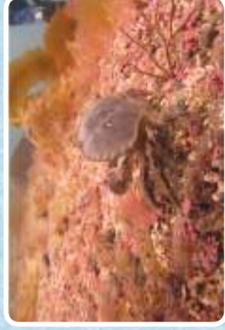
Brown crab on maerl

Maerl is a coralline (hard) red algae which creates a colourful, fine-branching layer on the seabed. This habitat has high species diversity, with shellfish, anemones, urchins, crabs, shrimps, worms and fish found here. It also provides a nursery ground and refuge for juvenile queen scallops and whelks — two of the island's commercially important species. Maerl also plays a part in slowing the effects of climate change, by depositing calcium carbonate and acting as a 'blue carbon' store.