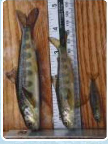
Salmon fry and parr

Laxey derives from the Norse word for salmon river (Laxa). Both Atlantic salmon and sea trout move upriver to breed, whilst the European eel leaves our rivers to breed in the Caribbean. Such complex life cycles make these fish vulnerable to many different hazards and so they are heavily protected on the island, both in MNRs and under fisheries legislation. This is an example of how MNRs can help protect our biodiversity and cultural heritage.