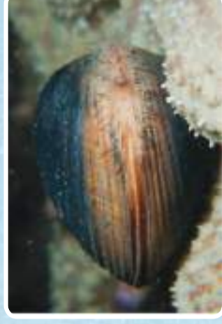
Iceland clam

Minke whale • Iceland clam • Bottlenose dolphin • Seabird species Masked crab • Salmon and sea trout • European eel • Whelk Purple heart urchin