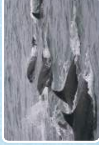
Bottlenose dolphins

Bottlenose dolphins tend to be seen during the winter and can appear in super-pods of over 100 individuals off the east coast. This pod, based on photo-identification, is thought to be from Cardigan Bay and they move frequently between the Welsh coast and the island. They are here feeding on the schooling fish in the area, which also bring in other cetaceans such as minke whales.