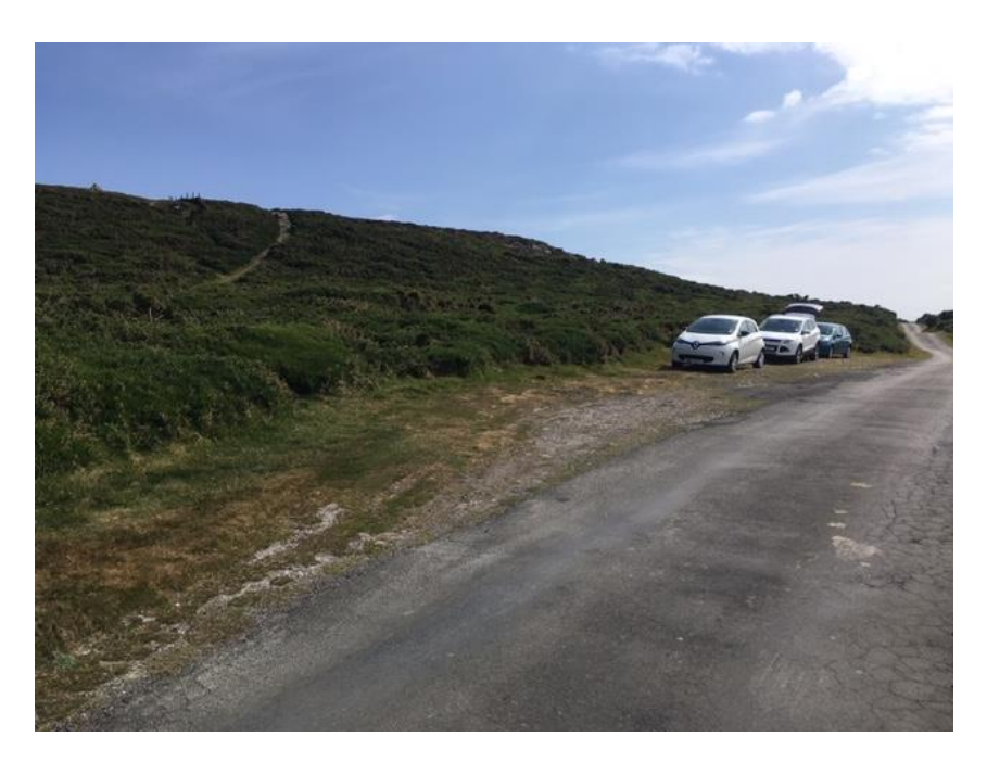
Parking area at the bottom of the path