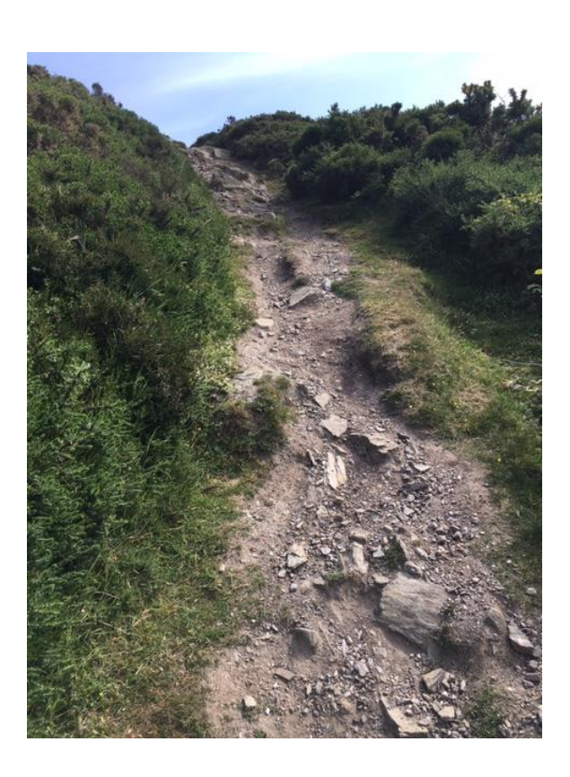
Showing steep path and rough terrain at the top of the route