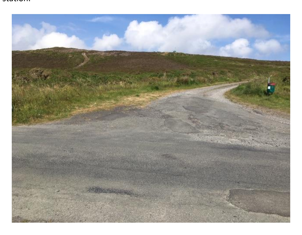
Alternative route to the Meayll Circle

This route also leads you past the remains of a Second World War Chain Home Low Radar station.