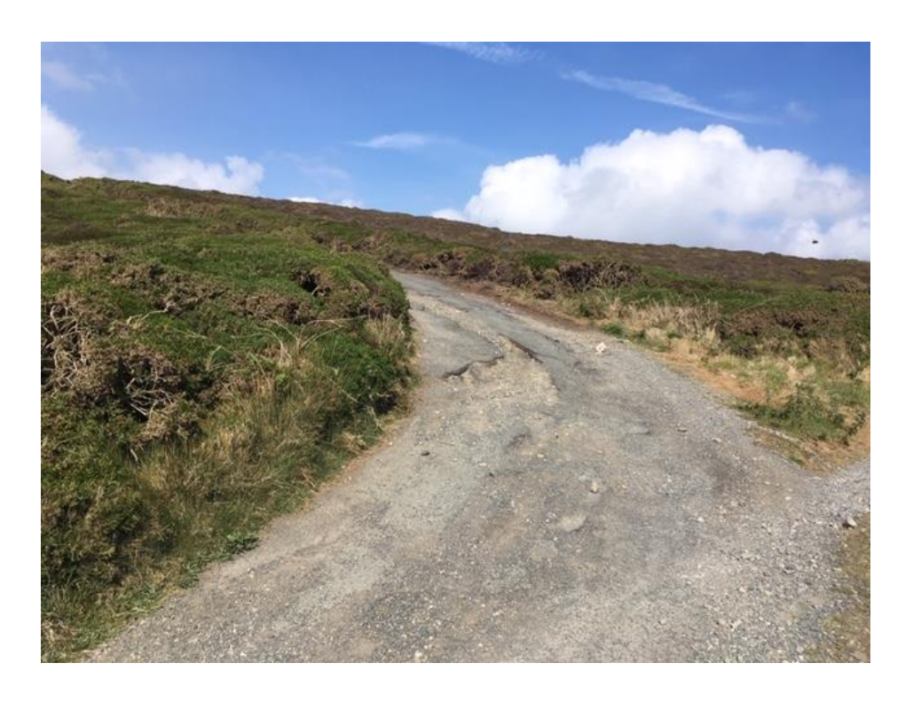
Alternative route to the Meayll Circle – showing green lane